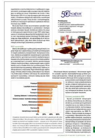
350 Euro 1/4 page advertisement in the market analysis section