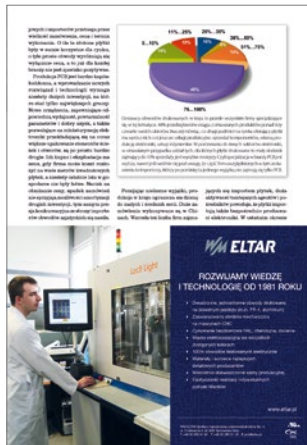
650 Euro 1/2 page in market analysis section