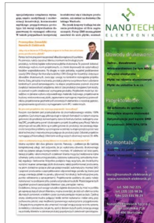
520 Euro 1/3 page in market analysis section