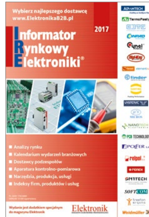
320 Euro company logo on the cover