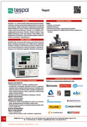
630 Euro full page company presentation